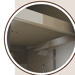
16 gauge shelves