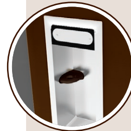
Single point latch